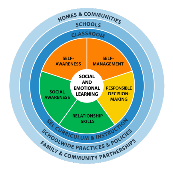
Figure 1: CASEL's Framework for Systemic SEL

The return to school this year will be unlike any other in our history and will be emotionally charged for students and adults. This moment will call on all members or our school communities to deepen our social and emotional competencies and create equitable learning environments where all students and adults process, heal, and thrive. CASEL's five core social and emotional competencies, situated within the contexts of classrooms, schools, and communities, may feel familiar to many educators, but take on deeper significance as we navigate a very different type of schooling: