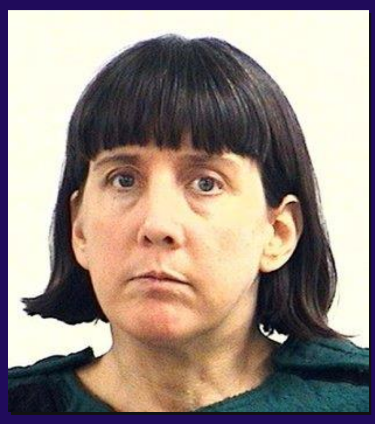
Amy Bishop 45 YOA University of Alabama Huntsville 3 dead/3 wounded/In custody Attempted suicide in jail 06/28 02/10/2010