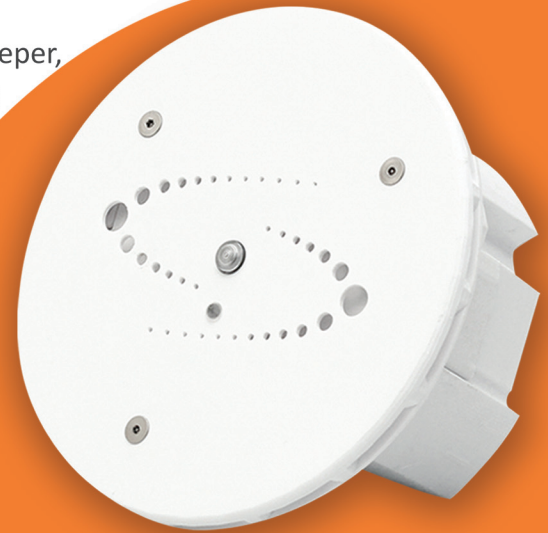
*HALO IOT Smart Sensor - Patent Pending*

There is no more excuse for the thousands of security incidents that occur each year in privacy areas, get the protection of HALO!