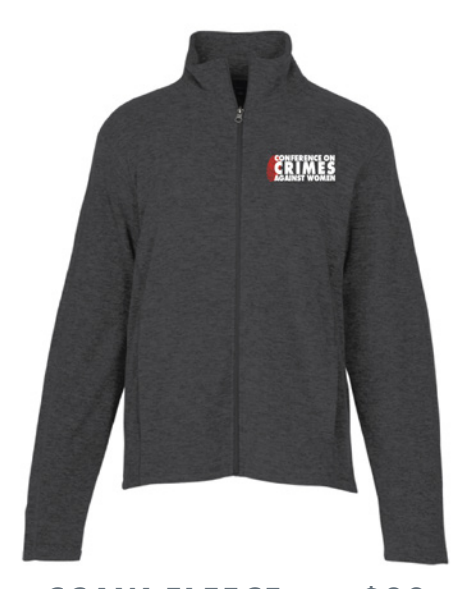
CCAW FLEECE • $30