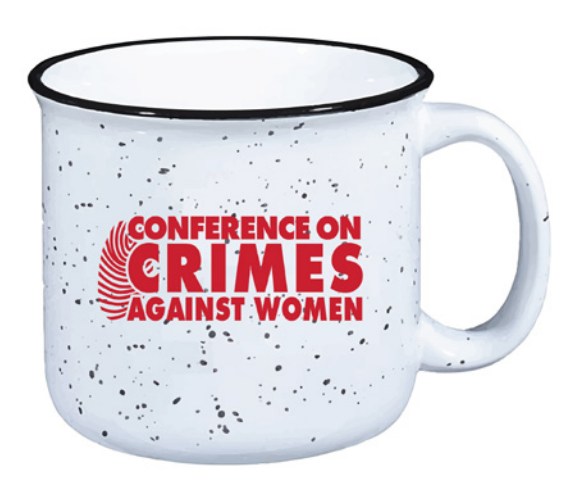
CAMPFIRE MUG • $10

These items are available for sale at www.conferencecaw.org/store.